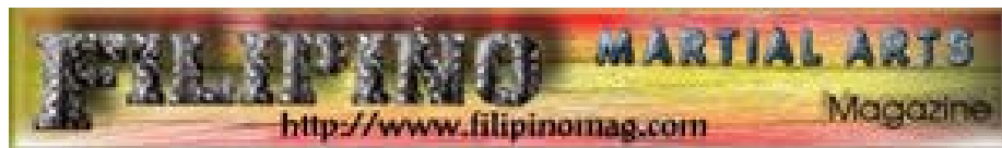
Filipino Martial Arts Magazine

The Kali Academy of Martial Arts is located at 4611 B – 50th Ave., Red Deer, Alberta Canada, T4N 3Z9. You can contact then by phone at 403-343-3350 or Email