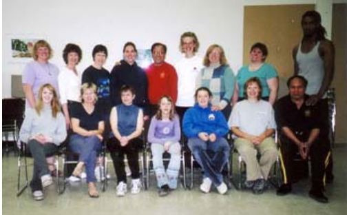
Canada Agricultural Employees and Family Seminar

As a service to the community, the Kali Academy offers and provides free basic self defense courses to High School and Junior High Students, including organizations like the Family Services Bureau and other corporations as part of their OSH (Occupational Safety and Health) programs to create awareness, preventive measures and basic self defense techniques.