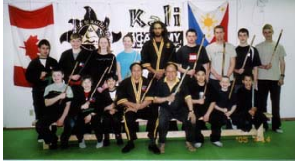
Kali Academy Class