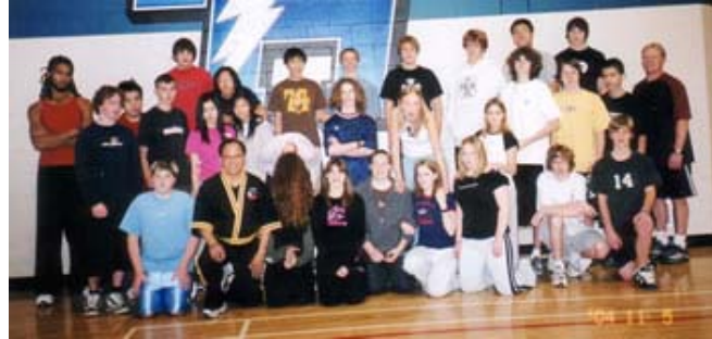
Hunting Hill High School Self Defense Class

The Kali Academy of Martial Arts is located at 4611 B – 50th Ave., Red Deer, Alberta Canada, T4N 3Z9. You can contact then by phone at 403-343-3350 or Email